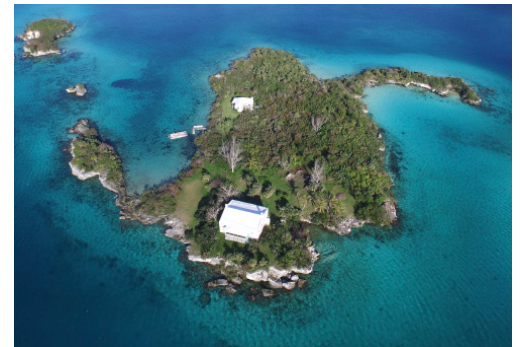
An ariel shot of Trunk Island

In addition to the Schools Programme, BZS has also been able to expand their Aqua Camp programme, with more activities for middle school students – the age group thought to be most socially at risk (ages 11-13 years) – and introducing a one-week residential camp for students age 14-15. Through both camp