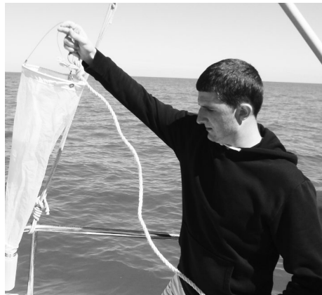
A Saltus student conducts scientific experiments while out on the open ocean aboard The Endurance as a part of the Marine Science programme.