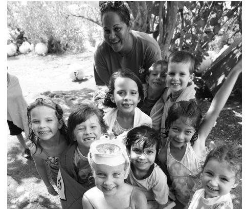
Students enjoying swimming with their camp teacher