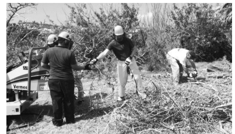
Weekend Warriors' and Corporate volunteer groups have made a significant impact on culling efforts at Trunk Island